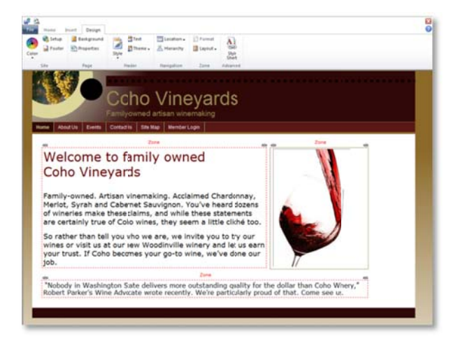
Easy-to-use web-based design tools